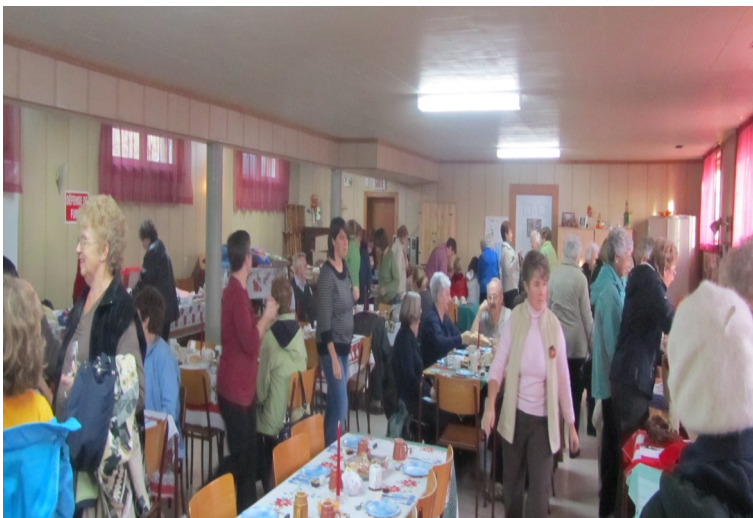
The 2011 York ACW Christmas Sale, held at St. Paul's Church in Gaspé

The ACW is counting on the community's continued support in 2012 to allow us to continue making a difference in our community.